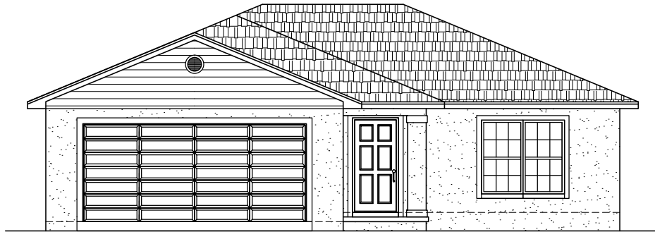
THE WINTER HAVEN (41'-6"W X 49'-0"D) © COPYRIGHT TRINITY DRAFTING LLC